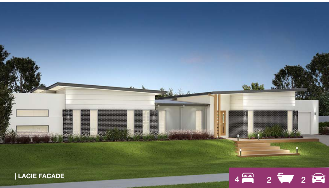
| LACIE FACADE