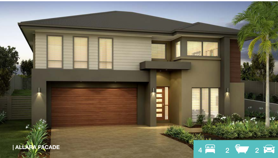
| ALLARA FACADE