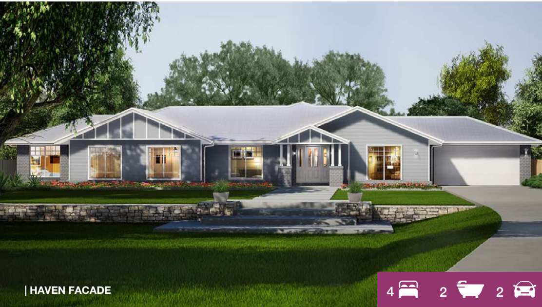
| HAVEN FACADE