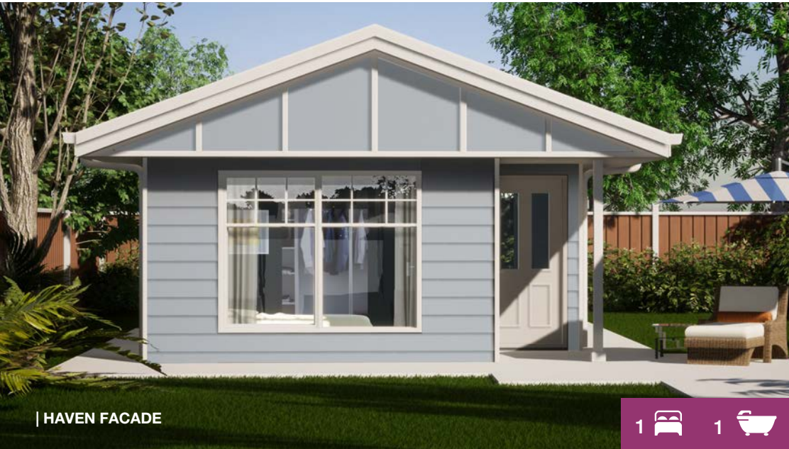
| HAVEN FACADE